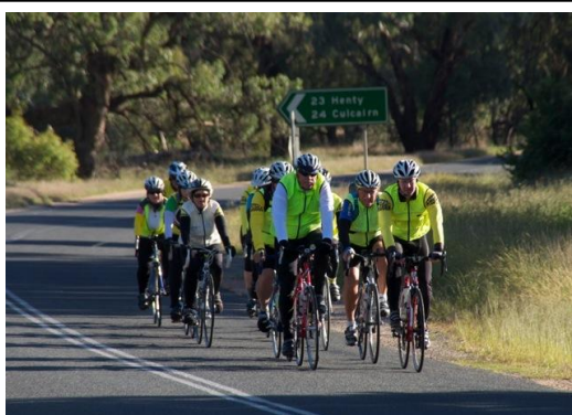
A neat bunch near Cookardina.

Rolling over the Hume at Kyeamba, I pulled in at the bus to get my bottles