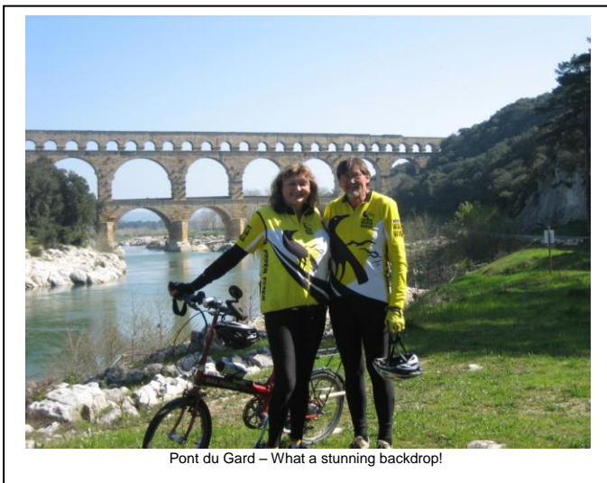
Pont du Gard – What a stunning backdrop!